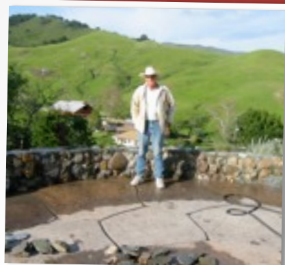
CHOP AND THE FINISHED WALL