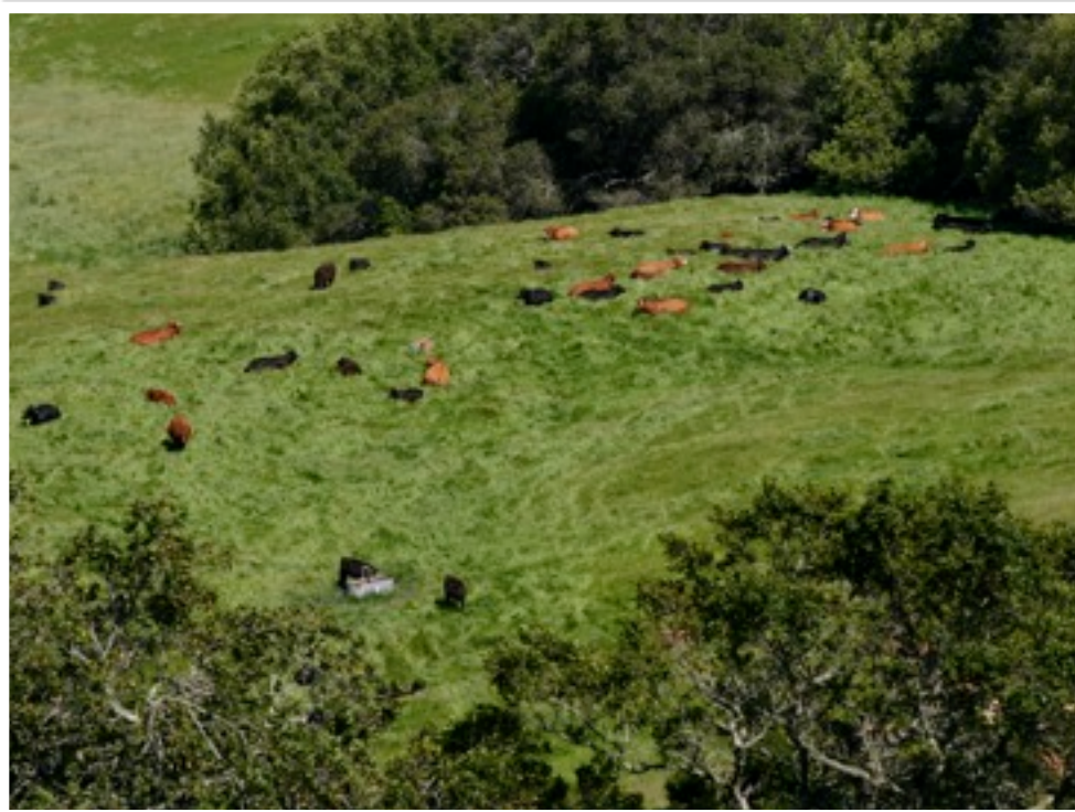
Cattle enjoying a spring day in the meadow