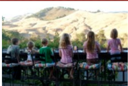
GUESTS EATING OUTDOORS