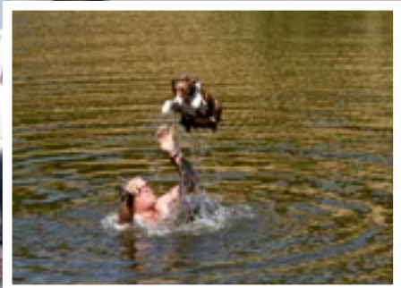
Sassy loves the pond but loves moving cattle more!